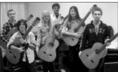
Juilliard Pre-College Guitar Ensemble