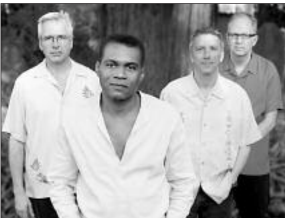
Robert Cray Band