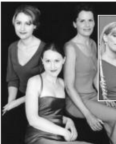
Appassionata Guitar Trio